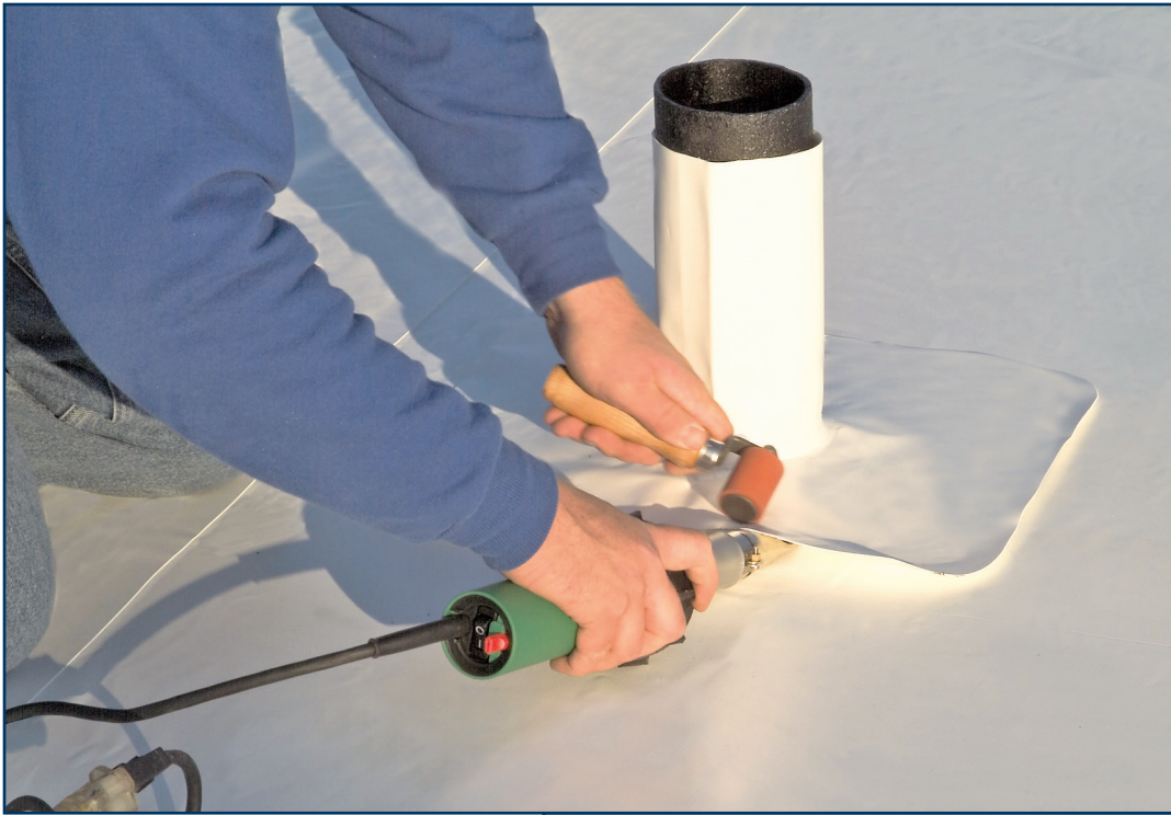
Figure 2 – Prefabricated pipe stack flashing.