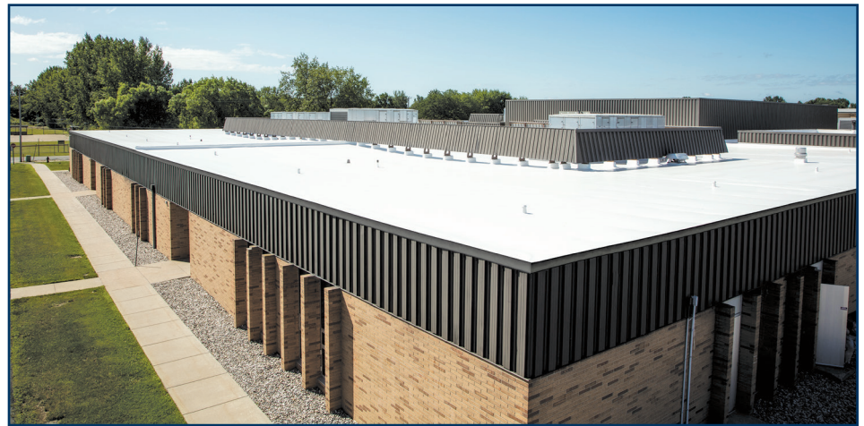
Figure 6 – Typical roof perimeter.

Further, a higher density of fasteners and plates in perimeter zones and corner areas, according to design criteria, can meet