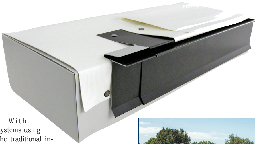
Figure 5 – Prefabricated drip edge system.

With systems using the traditional in-seam mechanical attachment of roof membranes, there is a separate set of screws and plates for insulation and membrane attachment. Induction welding, on the other hand, makes use of the same fastener and plate for both, without penetrating the waterproofing surface. This can result in 30-40% fewer fasteners overall, which translates into labor savings for the contractor (Figure 10).