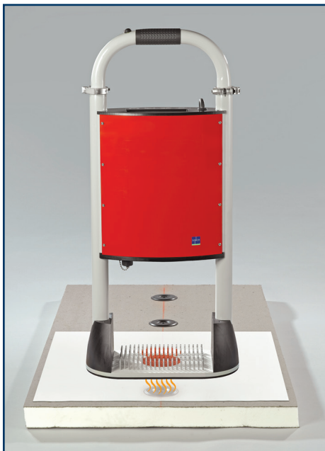
Figure 7 – Induction welding tool.

Labor shortages have taken their toll on the roofing industry, though not all of the news is bad. The development of prefabricated roof membranes, flashings, drainage, and perimeter components has