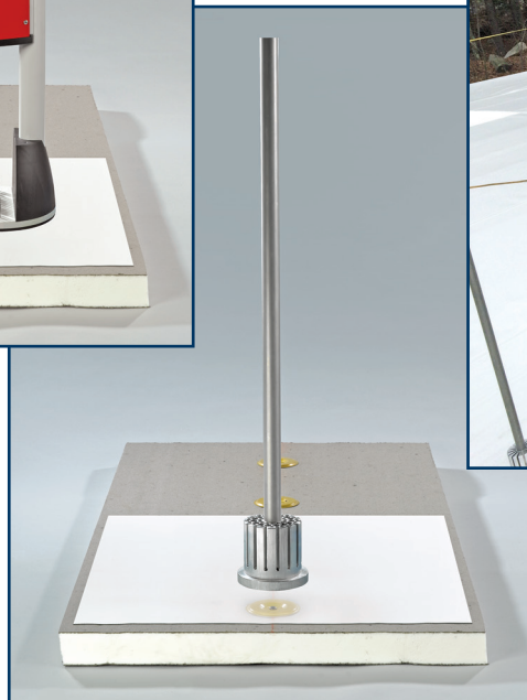
Figure 8 – Weighted magnetic heat sink to ensure bond.