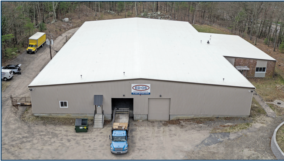
Figure 10 – Metal roof recovery combining purlin fastening and induction welding.

significantly reduced the amount of skilled labor necessary to accomplish seaming and waterproofing at critical locations on the rooftop. Couple this with induction welding technology for membrane attachment, and a contractor has a successful formula for roof installation under a variety of conditions.