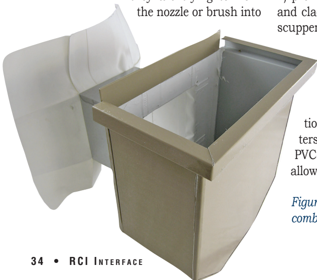
Figure 4 – Custom prefabricated scupper combining metal and membrane.

In light of today's labor shortages, roofers using induction welding (Figure 9) as a method of thermoplastic membrane attachment have reported increased productivity while simultaneously delivering improved roof system performance.