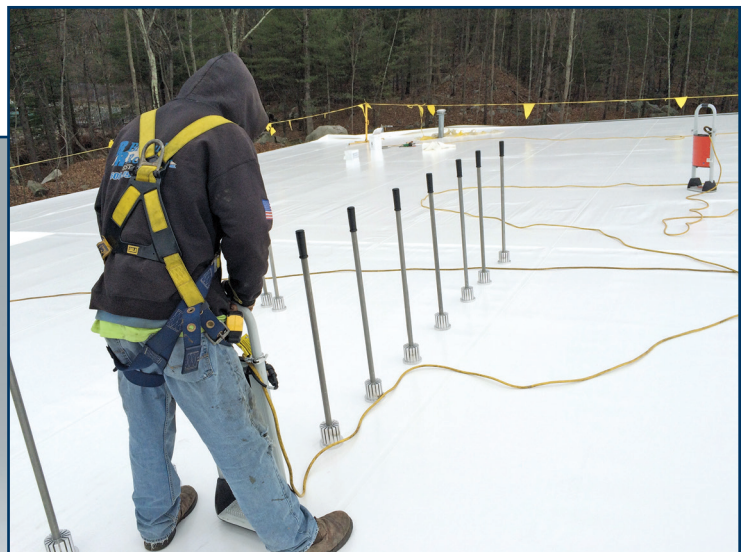
Figure 9 – Induction welding production process.